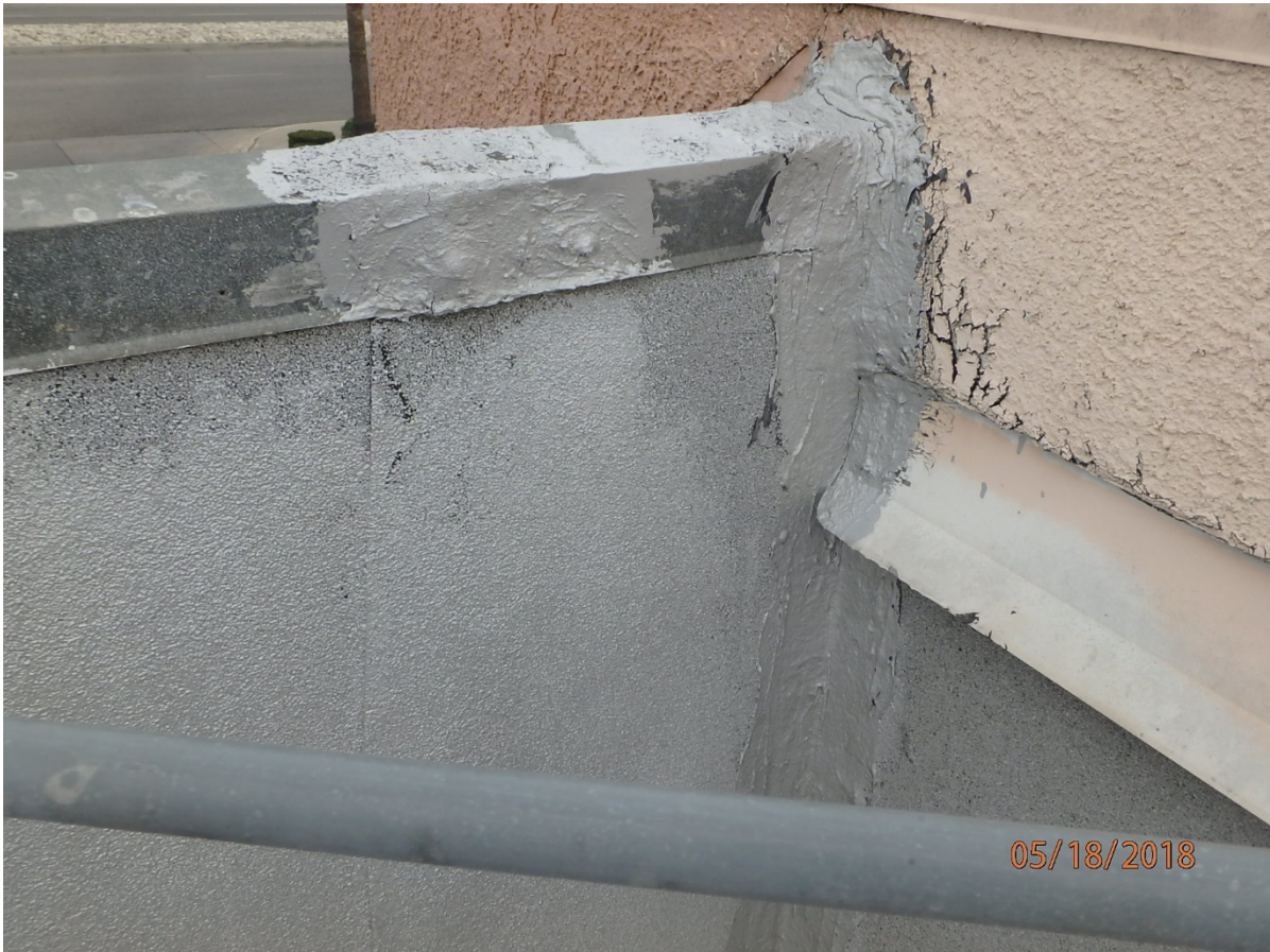
Demo stucco and Install coping saddle at stucco