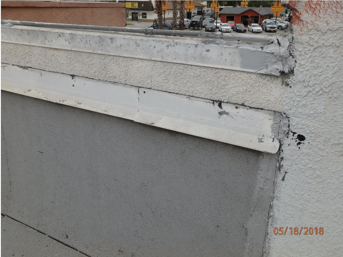
Replace coping metals