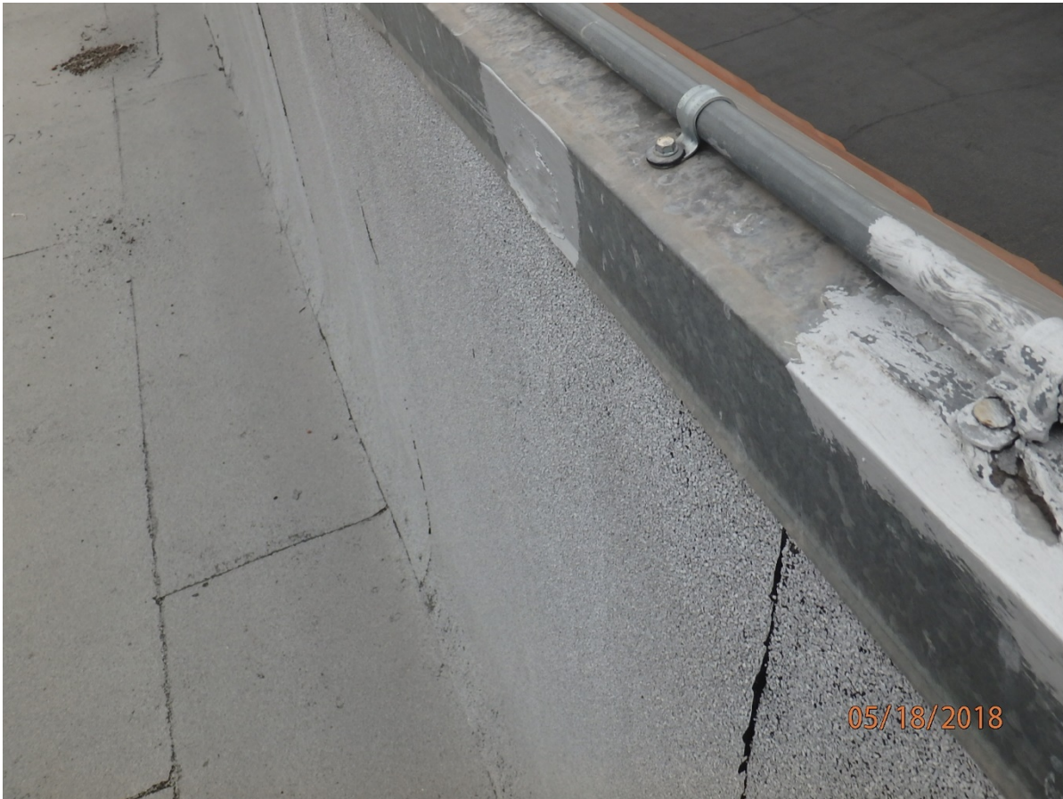
Move conduit to inside of coping