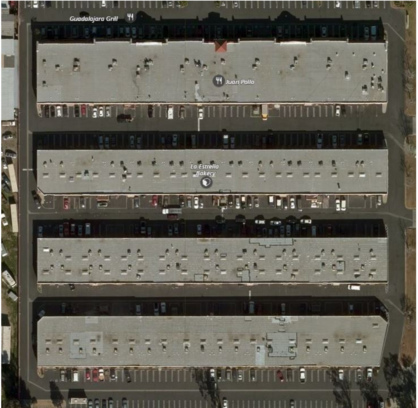
OVERVIEW PHOTO #7