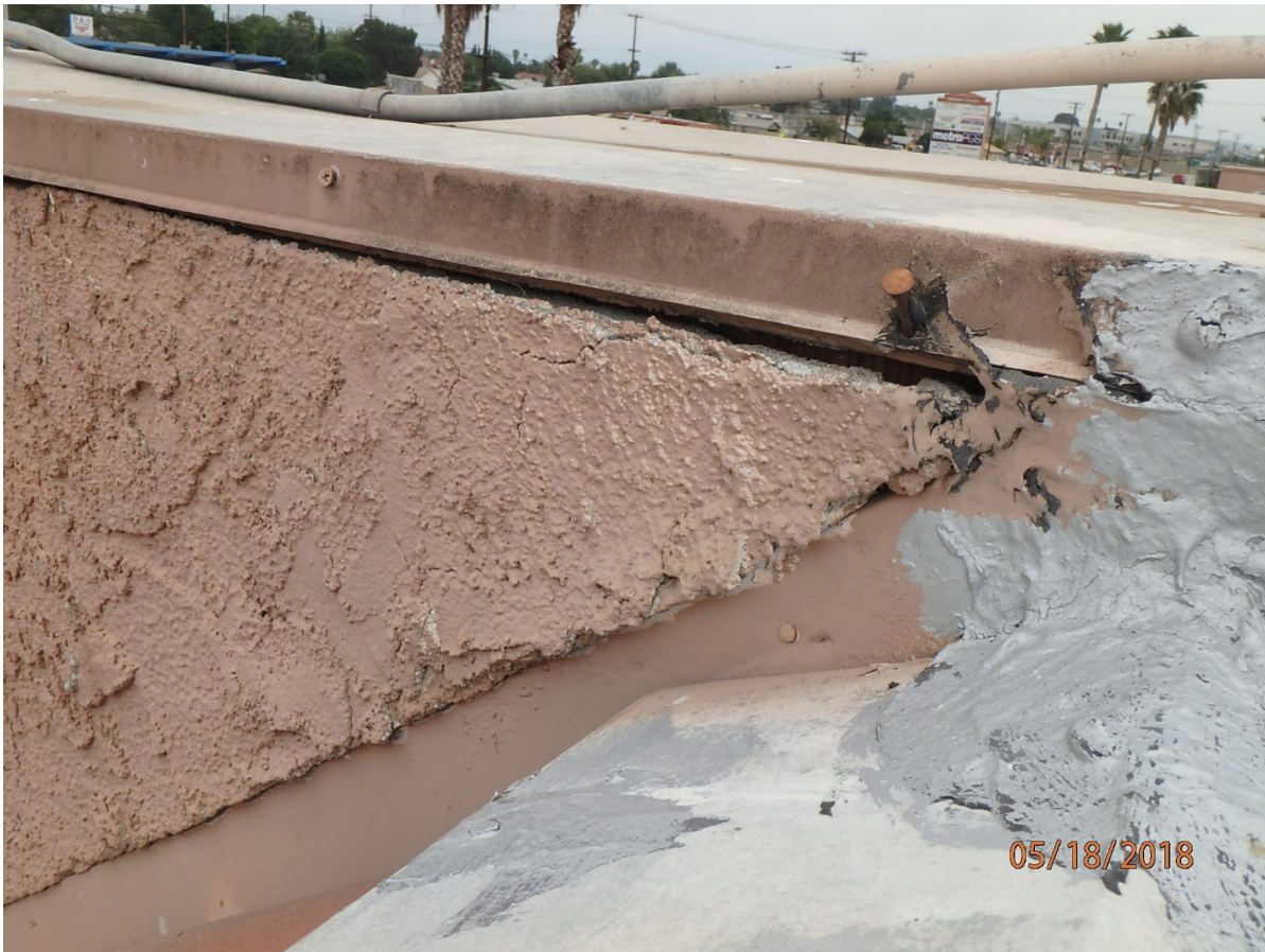
New coping cap to cover stucco