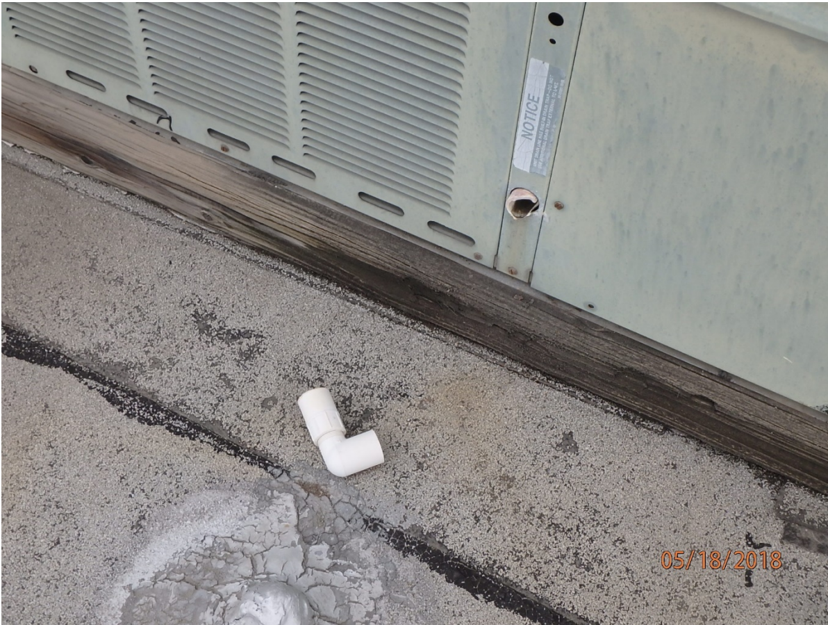
Replace damage HVAC sleepers