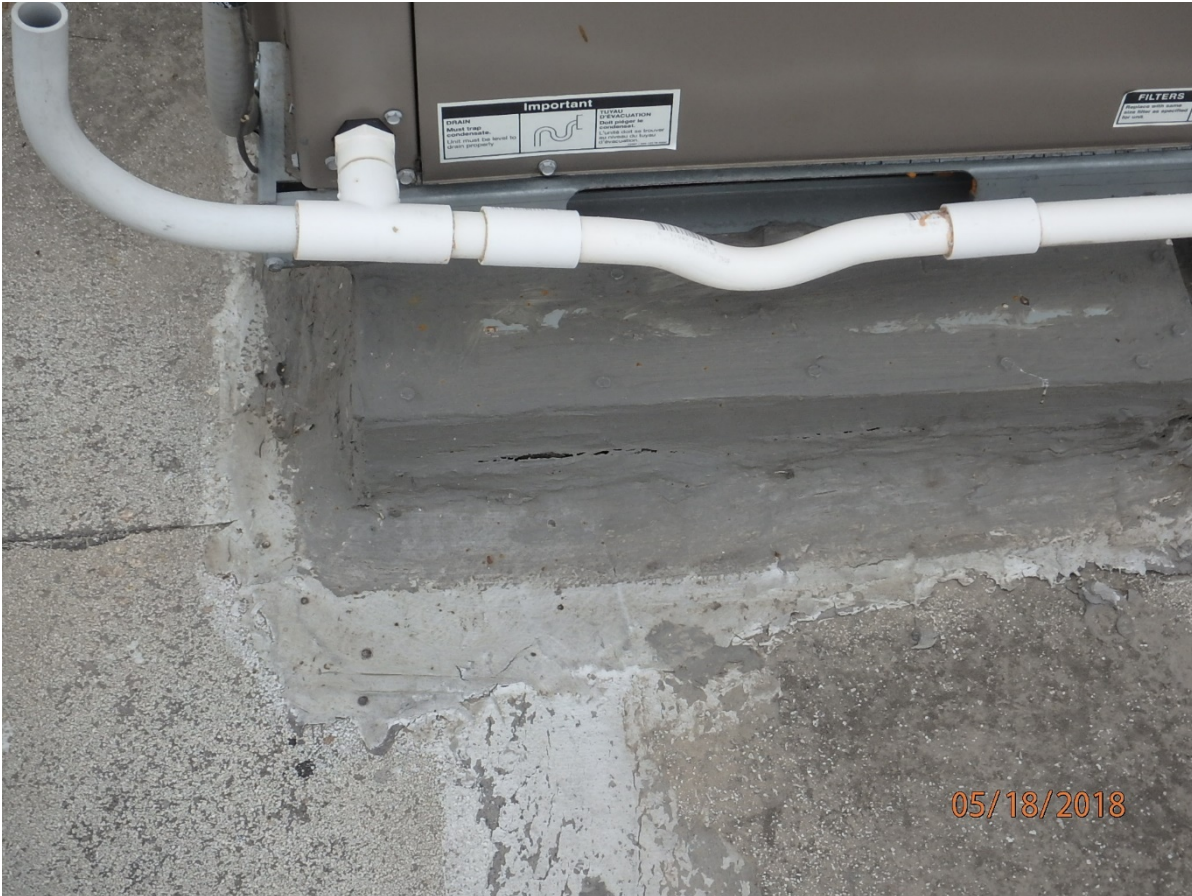
Install new HVAC sheet metal pan